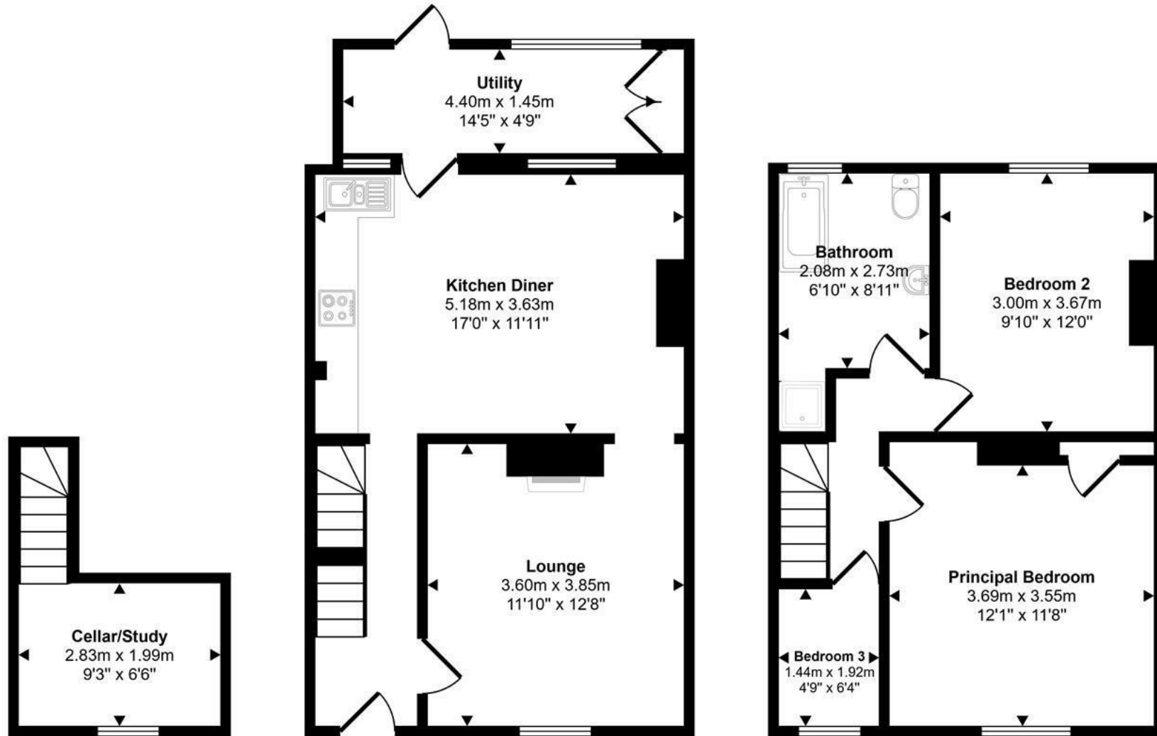
Lower Ground Floor Approx 7 sq m / 75 sq ft

Approx Gross Internal Area 96 sq m / 1030 sq ft